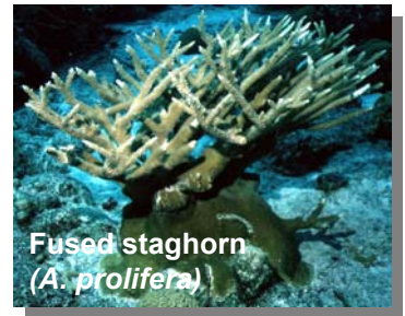
Fused staghorn ( A. prolifera )

Acroporids are typically found in water temperatures from 66°F to 86°F. Some degree of stress is experienced at water temperatures greater than 2-3°F cooler or warmer than normal for an extended period.